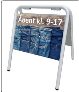
Art. 3307 with alu/zink plate