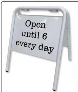
Art. 3310 with white plate